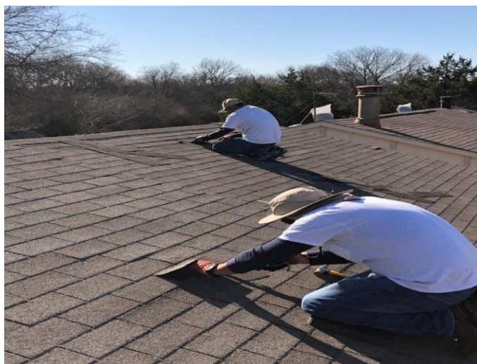
Juan Torres and Jesse Zuniga

The menu included catfish, Hush Puppies, French fries, salad or coleslaw, drinks of all kind, jalapeno's, pickles, and even turned the catfish into fish tacos if so desired. It is a tall order to serve nearly 250 people in a very short period of time. Nearly every Friday afternoon and early evening 32 – 35 Knight joined together to make the fish fry a success. You can read about the fish fries on our website – www.kofc8157.org .